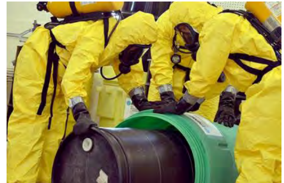
Haz Mat Team

https://homelandsecurity.iowa.gov/programs/lepc/