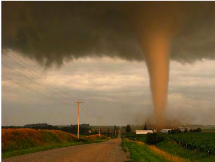
Tornado near Iowa farm