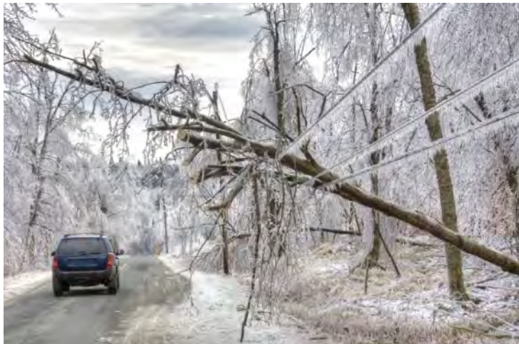
Ice storm impacts power lines